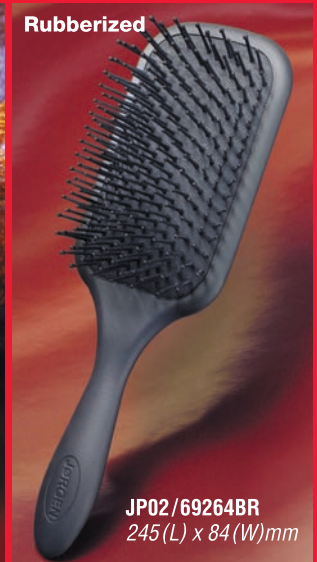
JP02/69264BR 245(L) x 84(W)mm