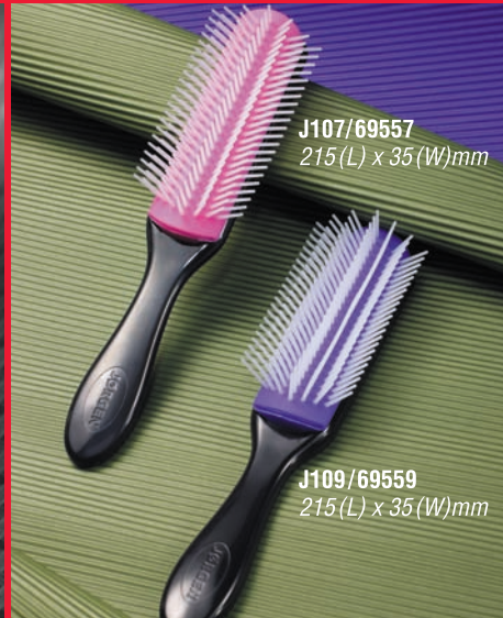
J107/69557 215(L) x 35(W)mm