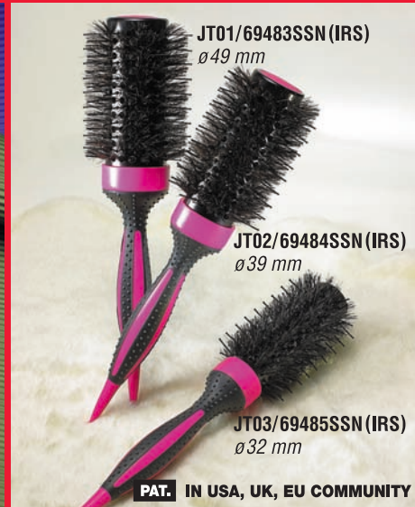
JT01/69483SSN (IRS) ø49 mm