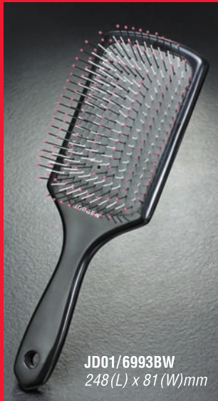
JD01/6993BW 248(L) x 81(W)mm