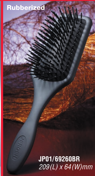
JP01/69260BR 209(L) x 64(W)mm