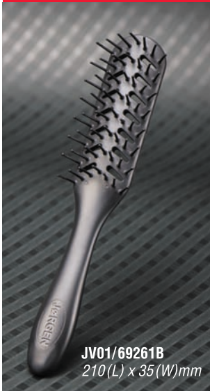
JV01/69261B 210(L) x 35(W)mm